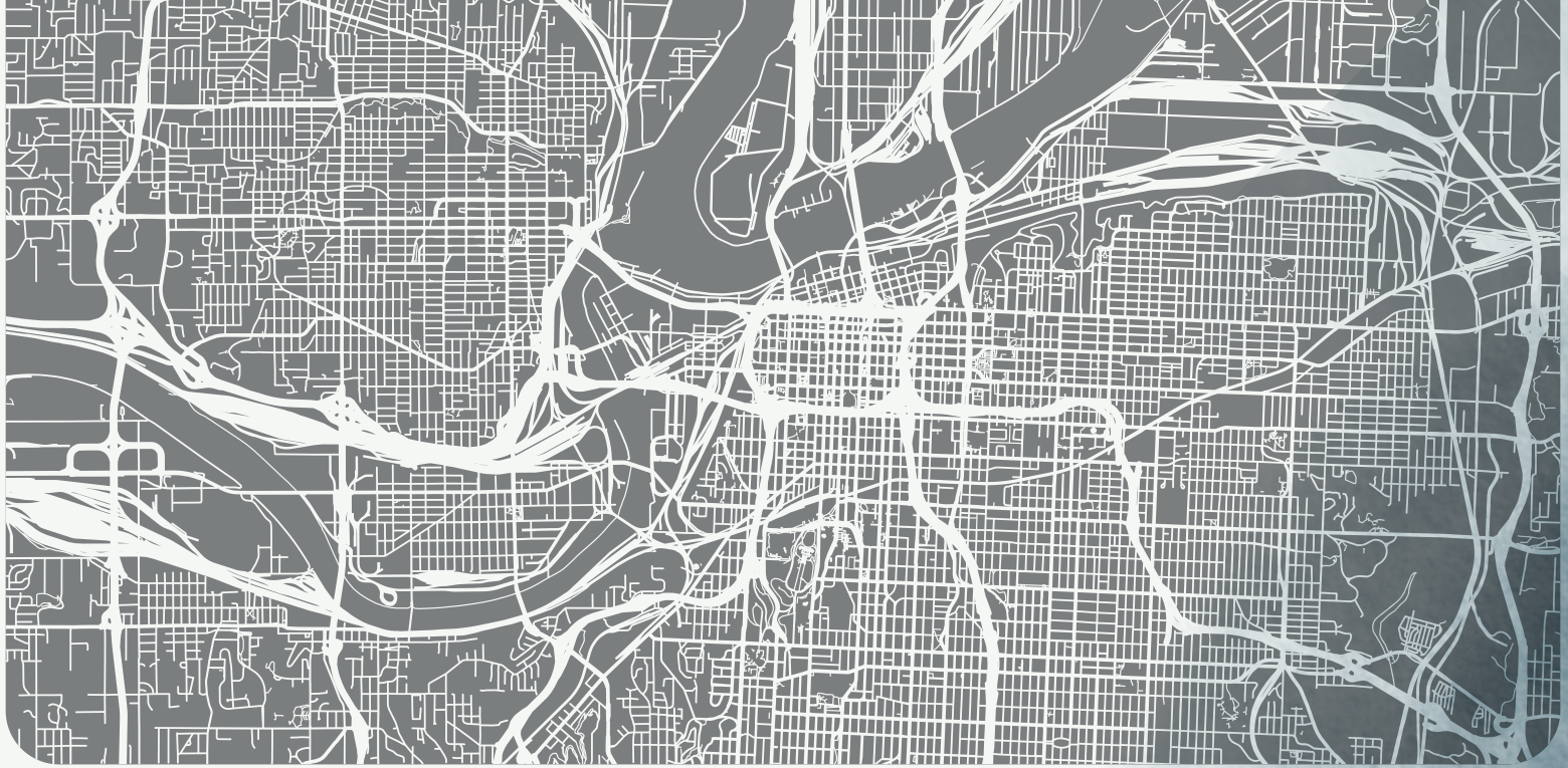
Kansas City, Missouri