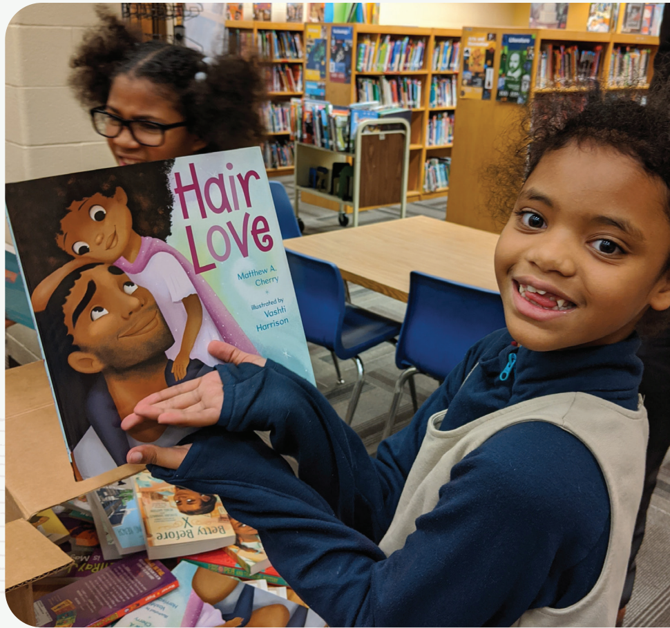
Representation Matters.

Access to useful, targeted data means understanding what's happening at every site in real-time.