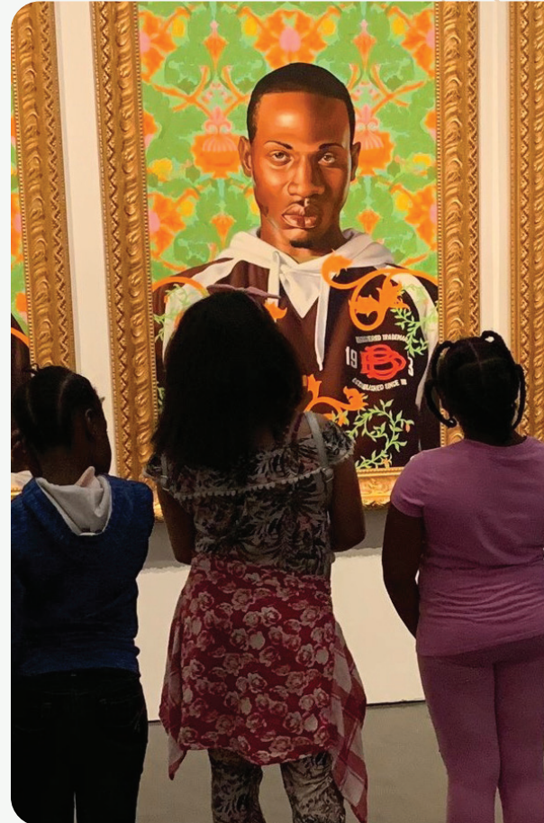
"We have to talk about these things."

Learn how Apricot 360 can bring nonprofits and government agencies together to improve community outcomes.