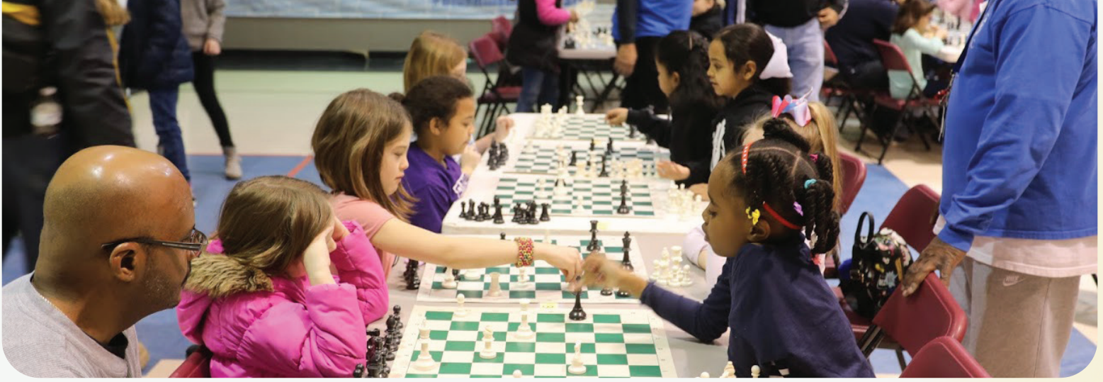
LINC Chess Girls Tournament at Fire Prairie Elementary, Fort Osage School District. 2019.